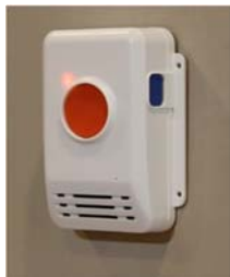
Wireless alert button

The Wireless AAS is part of the Singapore Government's Smart Nation movement to improve public service delivery and enhance citizens’ lives through digital innovation